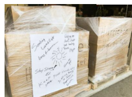
Pallets of products leave the Innersense warehouse.