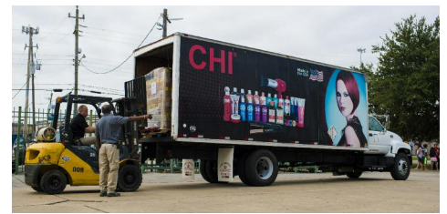
Farouk Systems trucks hit the streets of Texas to help with hurricane relief.

Donations will be collected in stores and at local fundraising events. Sport Clips will also host The Biggest Haircut Day of the Year on Veterans Day, November 11, when the company donates a dollar for every hair service to the scholarship program. Participating stores will also offer free haircuts to service members and veterans with valid military identification. Visit sportclips.com .