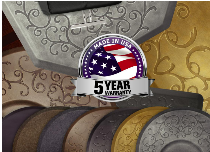
The Smart Step Designer Series features high quality and functional mats in a variety of decorative patterns and colors.

Seeing the opportunity, I formed a partnership with a polyurethane manufacturer that has a successful 50-year history. It was very clear that the beauty industry totally embraced the premium mat category, and Smart Step worked with a master distributor for the next 10 years to answer the call. That allowed us to further develop and perfect the mat products and heavily concentrate on many other industries that also saw the need for Premium Anti-Fatigue Mats.