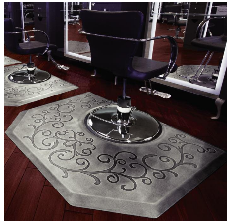
Smart Step Mats interact with the body, suspending body weight and effectively taking impact off the back, hips, knees and feet.

5. Smart Step Mats have a polyurethane protective clear coat. As a result, hair is easy to sweep, foot traffic is minimal and the clear coat acts as a barrier to hair color.