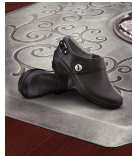
New Klogs Footwear features a thinner version of the same proprietary polyurethane technology used in Smart Step Mats.

▶ We provide tremendous customer service and marketing support. All product and lifestyle images are available in high-resolution formats at http://www.smartstep-gallery.com/ , making it easy for distributors and reps to view and share the collection.