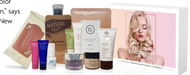
CPNA & New Beauty have collaborated on this beauty box.

Valued close to $200, the limited-edition box sells for $29.95. To purchase, visit newbeauty.com . CPNA returns on July 29-31, 2018. Visit cosmoprofnorthamerica.com .